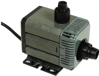
Submersible circulator pump model 55-C0191/6