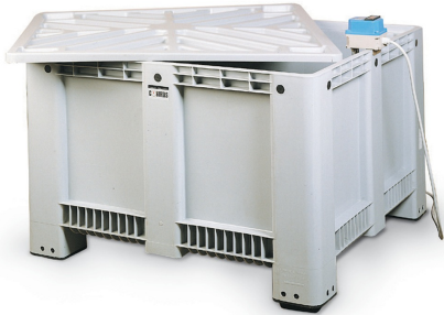
Heavy plastic curing tank model 55-C0193/A with thermostatic digital submersible heating system code 55-C0193/6 and cover code 55-C0193/A1

*Conventionally we have specified 150 mm cube specimens but, any other type or dimensions are accepted within the limit of the tank dimension.