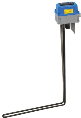
Thermostatic digital submersible heating system model 55-C0193/6 with detail of the control panel