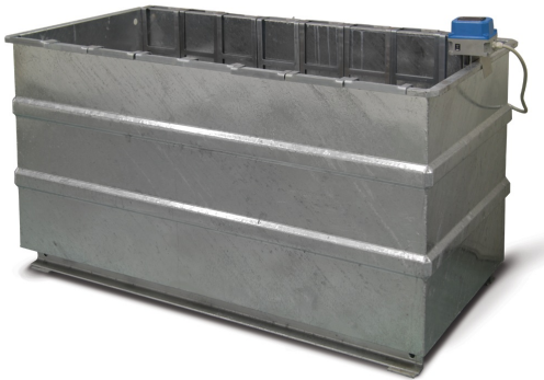
Galvanized steel curing tank model 55-C0191 with upper racks code 55-C0191/3